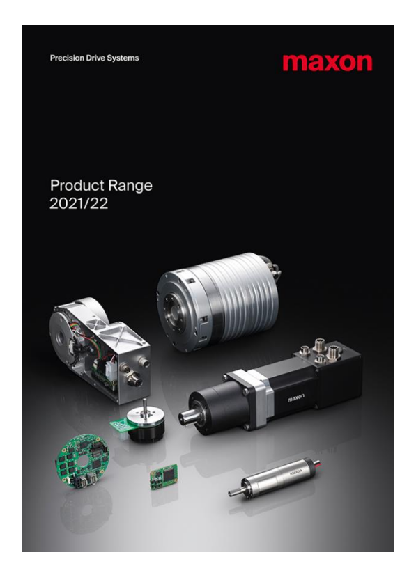
The new maxon product catalog 2021/22 © maxon

For additional information, please contact us at <a href="mailto:info.us@maxongroup.com">info.us@maxongroup.com</a> or 508-677-0520.