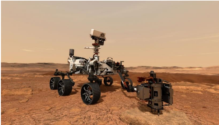
The Perseverance rover obtaining a sample on Mars (artist's rendition)

For additional information, please contact us at info.us@maxongroup.com or 508-677-0520.