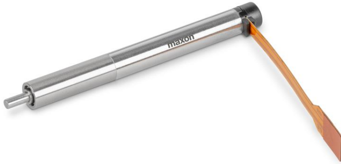
maxon ECX Speed 4 with gearhead and encoder