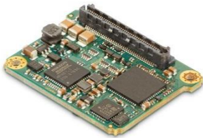
EPOS4 Micro 24/5 EtherCAT positioning controller